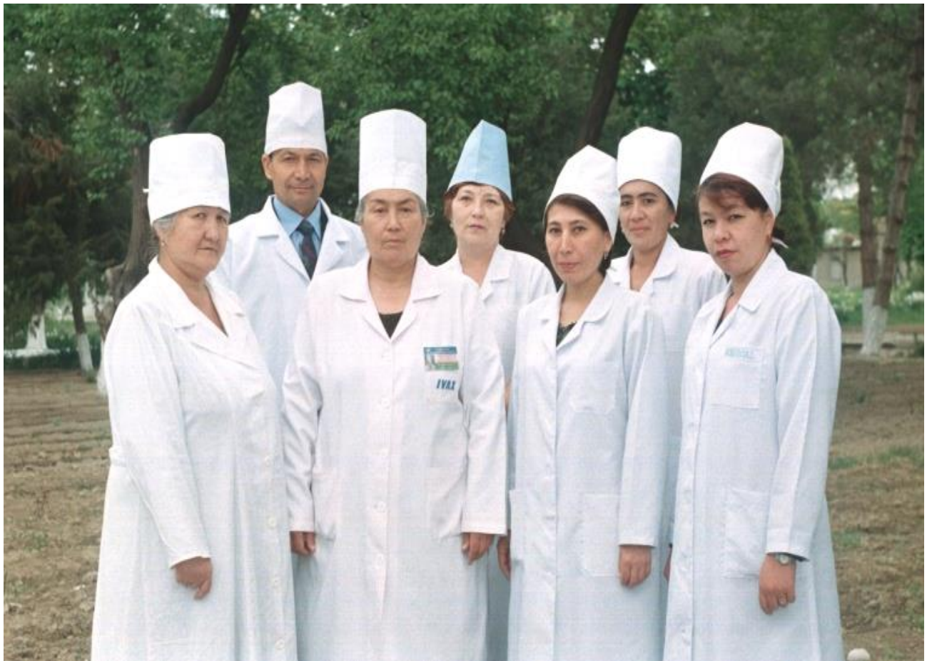
The chair in the years 2001- 2007