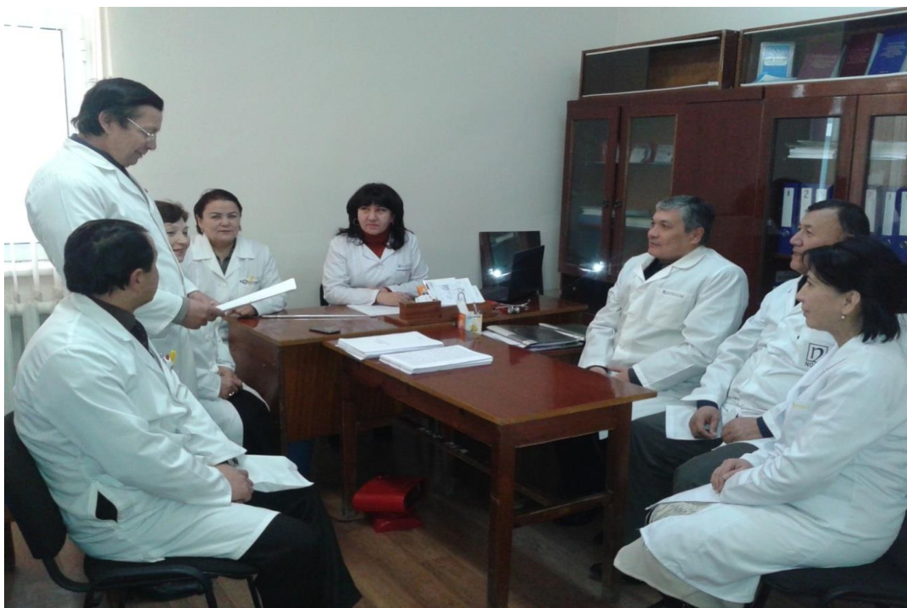
Educational- methodical meeting of the Department (2014-2015 years)