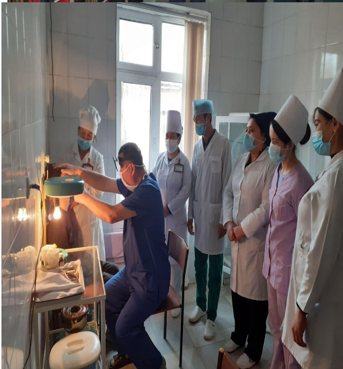
Participation of the department in spiritual and educational activities